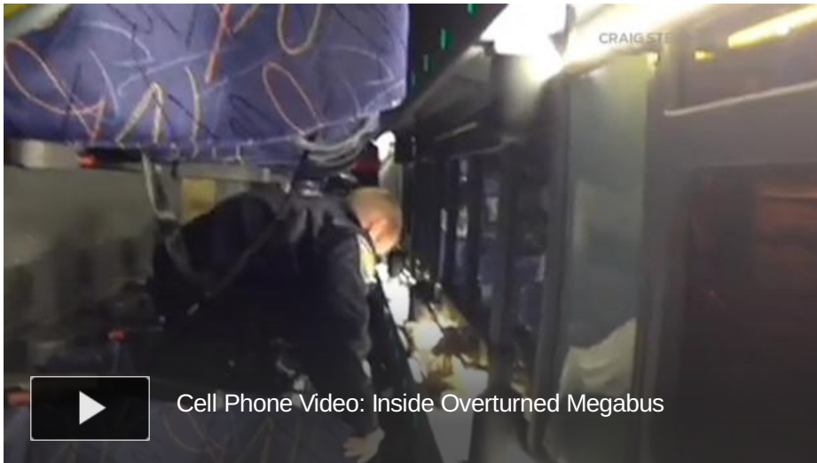
Cell Phone Video: Inside Overturned Megabus

The suit alleges Megabus was negligent in maintaining and operating the bus.