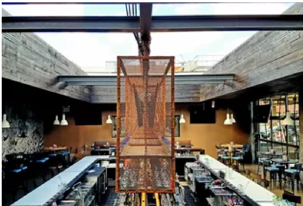
Federales is a Four Corners bar. Four Corners [Official Photo]

Four Corners , the owners of several Chicago bars — including Benchmark , Brickhouse Tavern , and WestEnd — have been hit with a class-action lawsuit by workers with an attorney alleging the company has withheld more than $30 million in tips from servers and bartenders from 2011 to 2018. The lawsuit names 17 Four Corners' establishments and could affect as many as 800 employees.