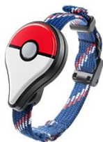
Nintendo Pokemon GO Plus Bluetooth Bracelet