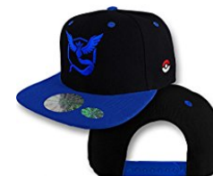
Baseball Cap Hats Pokemon Go Team Instinct Valor Mys...