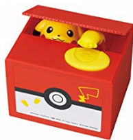
Itazura New Pokemon-Go inspired Electronic Coin Mo...