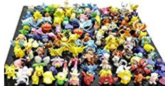
Generic Complete Set Pokemon Action Figures (...