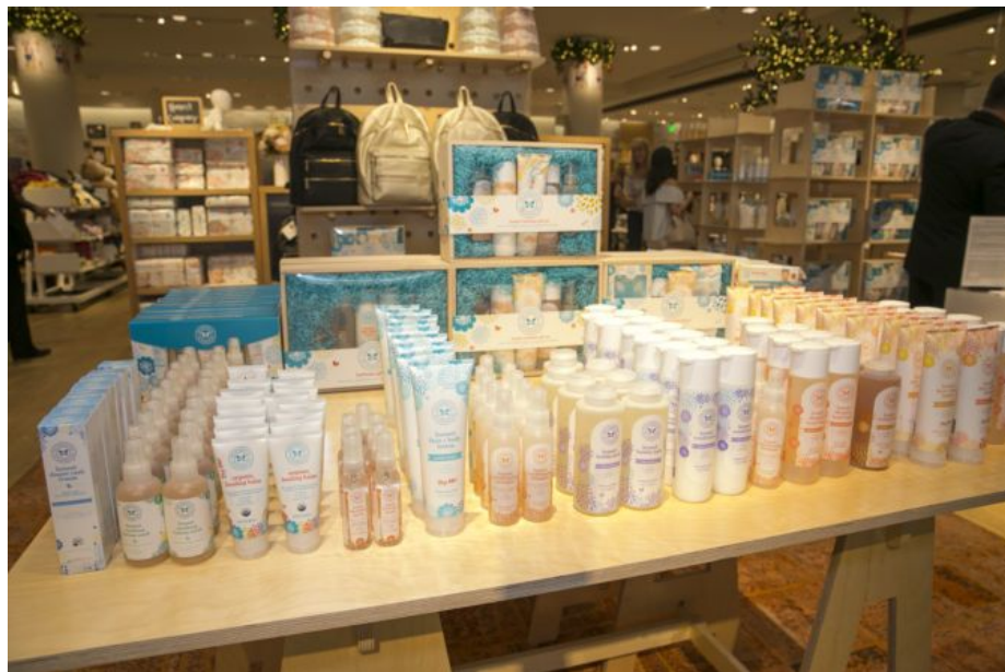
The Honest Company's products sold at Nordstrom in Honolulu, Hawaii.

agent for their soaps. The actress/entrepreneur firmly asserted that their goods are eco-friendly and safe for families.