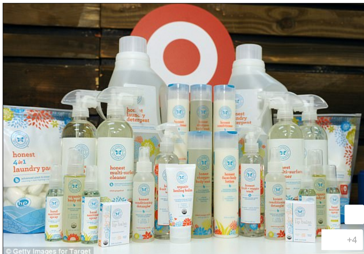
The company claimed Sodium Coco Sulfate was a gentler alternative to Sodium Lauryl Sulfate, but the plaintiffs note SLS is a component of SCS