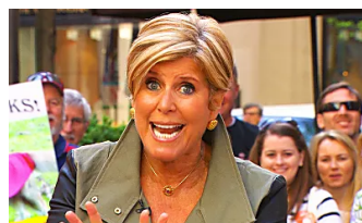
[Important!] - Homeowners Must Claim $4,264 "Discount" By Sep 30th! Smart Financial Daily