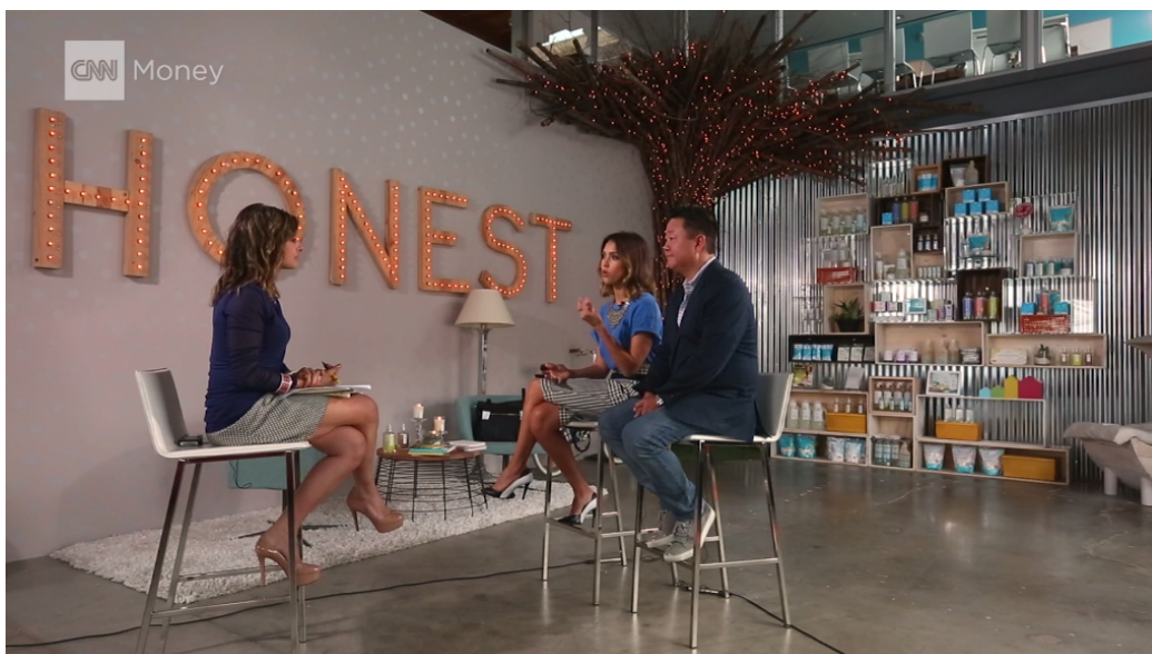
Jessica Alba: Honest is a brand you can trust

Have you bought Honest Company detergent? You may be able to get some cash back.