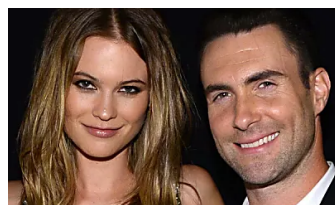
Hollywood's Most Gorgeous Couple is Making Moves (Like Jagger) Lonny Magazine